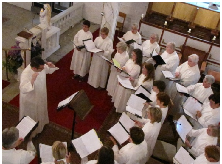
Concert at the St. Wigherti Priorat in Werningshausen (August 2012)