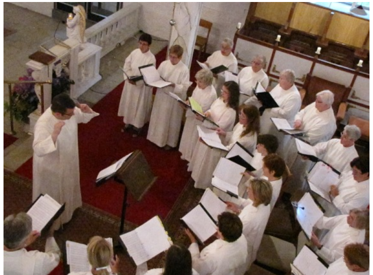
Concert at the St. Wigherti Priorat in Werningshausen (August 2012)