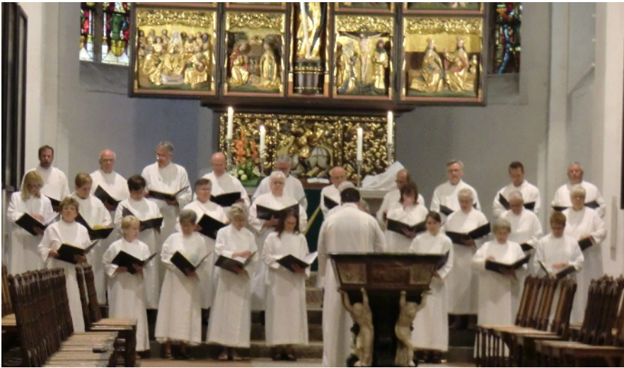
Bach Cantata Vespers Choir in the Leipzig Thomaskirche (August 2014)

Audition to sing with the choir or travel with us as we tour England and visit Leipzig in August 2016.