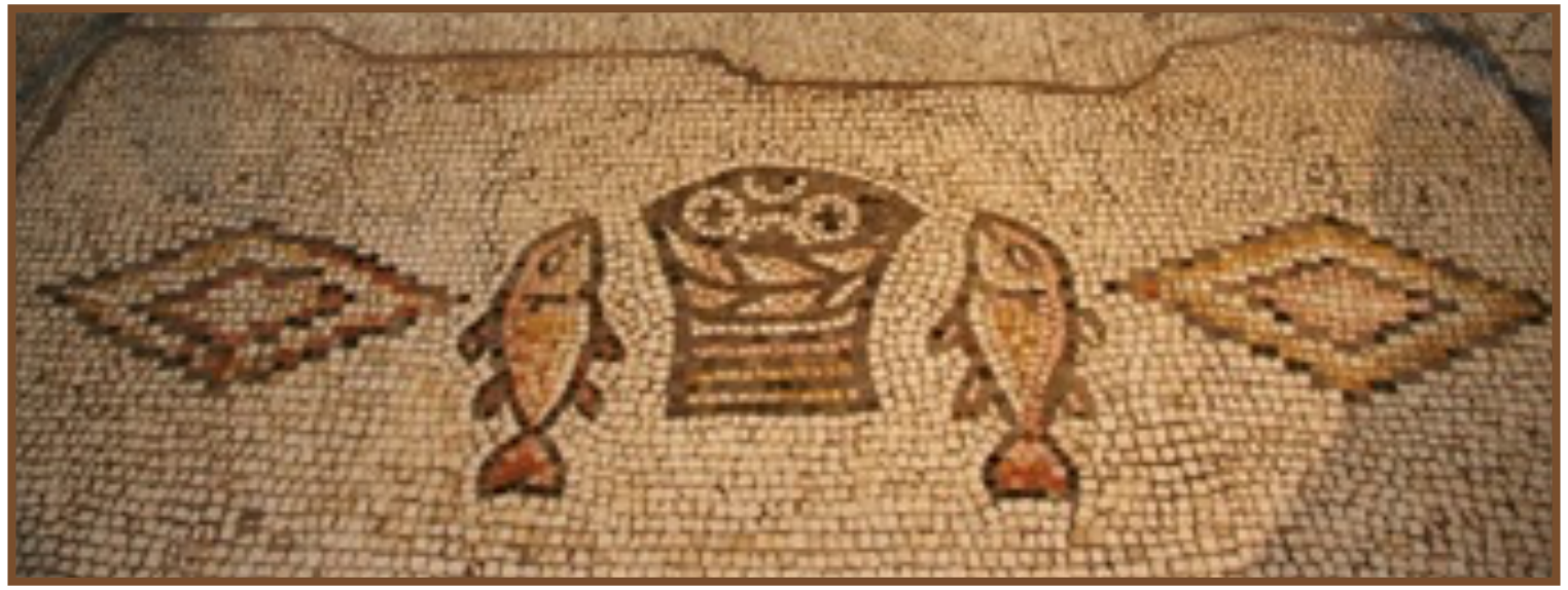
Ancient mosaic of the loaves and fishes from the floor of The Church of the Multiplication, at Tabgha, on the northwest shore of the Sea of Galilee in Israel.