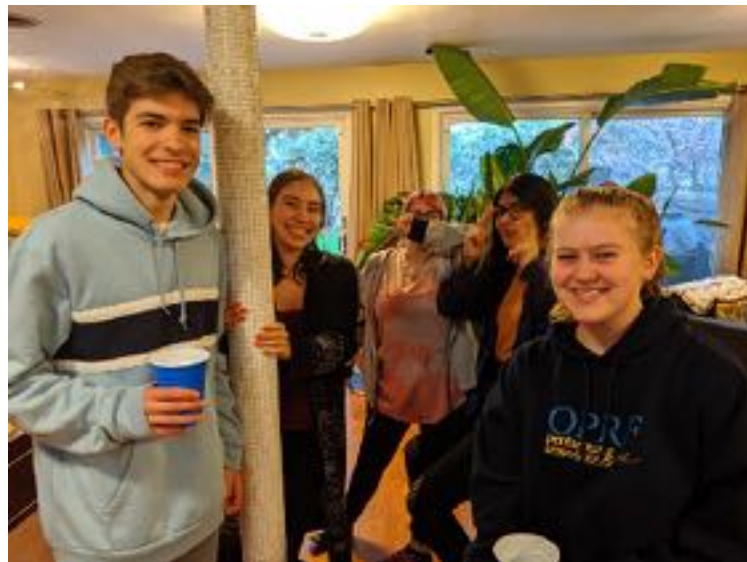
High school youth welcomed new 8th grade confirmands into Youth Group at the annual Door-to-Door Dinner on May 4.

Service to others is always impactful to those who participate – especially when the mission field is so different from our own backyards. We give thanks to God who beckons us into different corners of the world so that we might meet Christ in new faces and unusual situations. We also covet your prayers for travelling mercies and meaningful reflection during and following the trip.